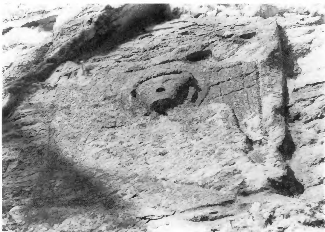
Fig. 4 Wall relief depicting the bust of an angel, St. Mary's church, Deerhurst.

The panel set in the remaining wall of the polygonal apse at Deerhurst depicts the bust of an angel, carved in high relief, in a different style from the figurative panel of the Virgin and Child discussed above. The angel (Fig. 4) is carved on a single panel of rectangular shape, measuring approximately 70 cm high × 50 cm wide. This is framed by a damaged flat border; the dark