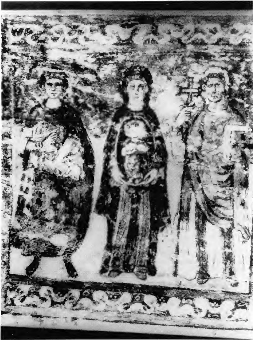
Fig. 2. Miniature from a Syriac Bible (Paris, Bibliothèque Nationale, MS. Syr. 341, f. 118: reproduced in J. Leroy, Les manuscrits Syriaques à peintures conservés dans les bibliothèques d'Europe et d'Orient (Paris, 1964), pl. 43, fig. 2).