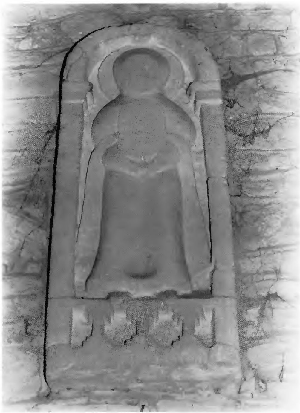
Fig. 1. Wall relief of the Virgin and Child, St. Mary's church, Deerhurst.