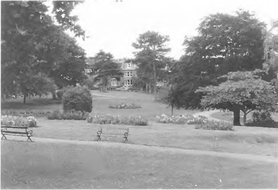
Fig. 3. St. Andrew's park.

the 12\frac{1}{2} acres could be obtained for a 'reasonable' price and that a provisional contract had been agreed. 46 Four years later, when there was little evidence of material improvement, the corporation received a rebuke from the ratepayers 'requesting the Authority to at once lay out St. Andrew's Park and appoint a caretaker'. 47 The following year the park was finally opened. A series of small land acquisitions was made about this time which increased the acreage at Stapleton 48 and gained municipal open space as a by-product of a street-widening scheme in the Haymarket 49 and yet more following the culverting of the River Frome above St. Augustine's Bridge.