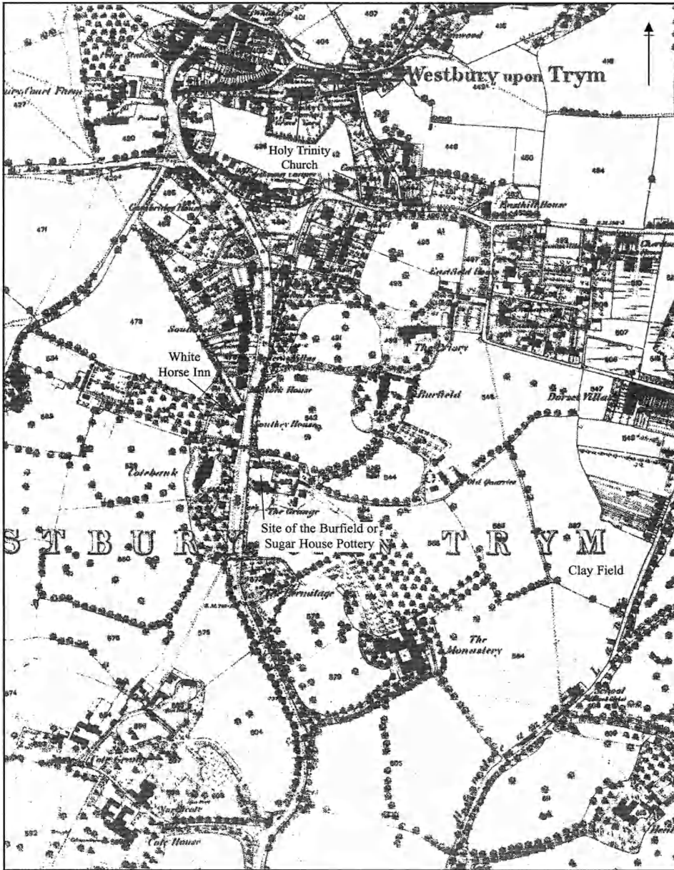
Fig. 1. Westbury-on-Trym c.1880 (based on O.S. Map 6", Glos. LXXI.NE., 1881 edn.).

From early medieval times the English earthenware potters had used lead glazes to render their products more attractive and less porous. When beaten into a dust and mixed with a slip, galena, the natural sulphide of lead, gave particularly good results and was widely used for glazing. Lead occurs in Carboniferous limestone and was mined on Clifton Down, close to Westbury, between