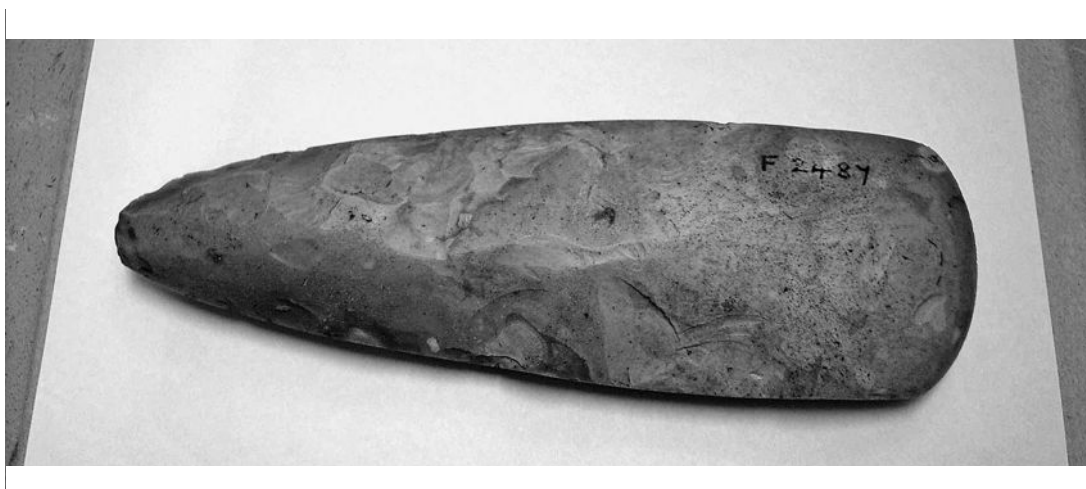
Fig. 6. Flint axe F2487 found by A.J. Selley on the Mendips near Barrow in 1912 or 1913.