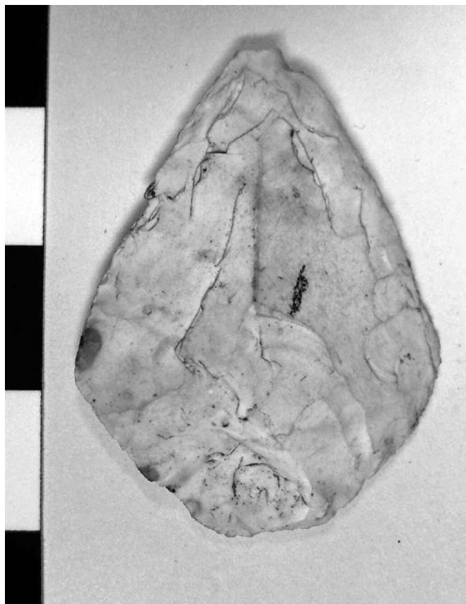
Fig. 5. Flint F2939 from Portbury.