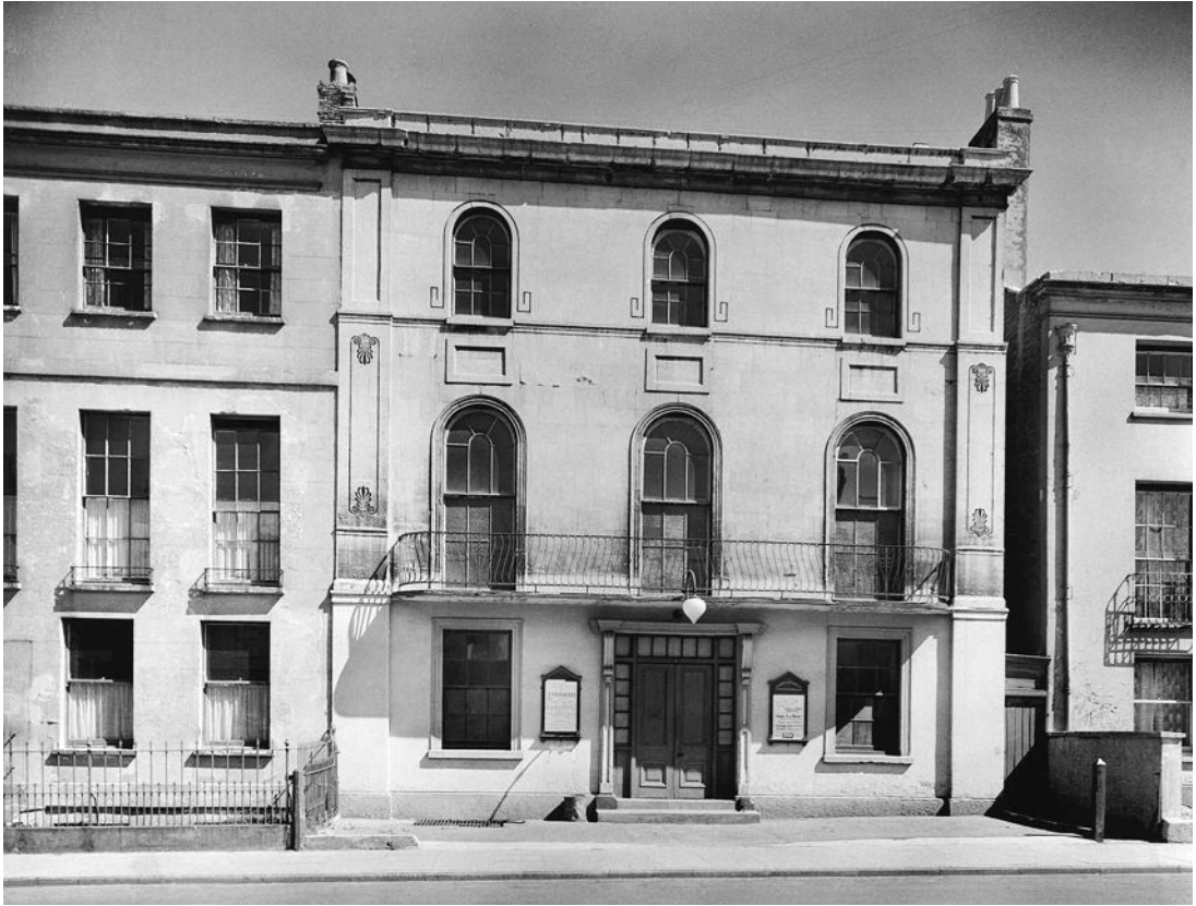
Fig. 1. No. 13 Portland Street in 1943.

Cheltenham (Fig. 2), possibly can be attributed to Underwood. This attribution is based partly on the architect's deployment of a double-incision motif, acting as a reductionist variant on the primitive Doric order, above the giant pilaster (Fig. 3). 33 Like 13 Portland Street's balcony (to be discussed), it is arguable that only a pupil of Soane such as Underwood could have had such intimate knowledge of such idiosyncratic architectural vocabulary. The slits recall the parapet slits above the Doric columns, in antis , at Soane's lodge of 1792–7 at Tyringham Hall, Buckinghamshire. The architect of St Margaret's Terrace placed a blank sunken panel above the second-floor window on the North Place return elevation – a device repeated three times on the façade of 13 Portland Street. 34 The Portland Street façade is a good example of the astylar classicism Soane and others were pursuing in an attempt to invent a new classical language. At no. 13 the repetitive use of the arched window, and the negative or sunken linear decoration, is especially Soanean, in particular