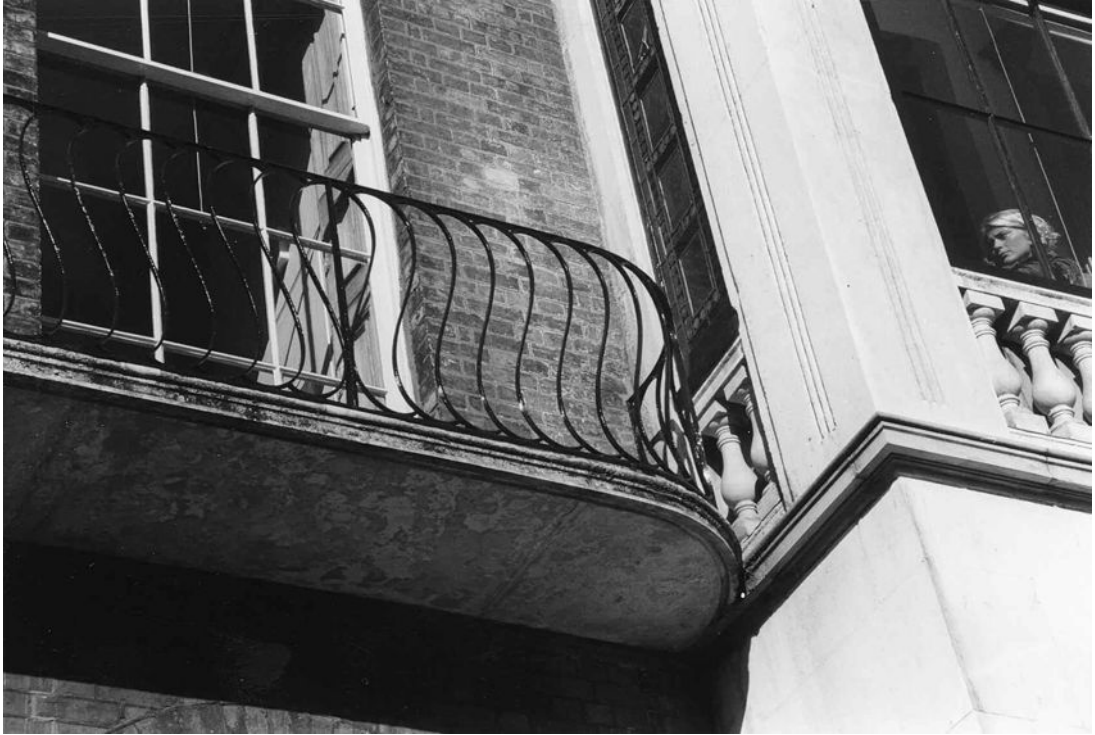
Fig. 5. Detail of first-floor balcony at 12 Lincoln's Inn Fields (1792–4), London.

was twenty-five feet. 41 It was thus slightly wider and higher than its neighbours and therefore the most architecturally prominent elevation on the east side of Portland Street. No. 13 Portland Street's construction is partly indicated by a side alley to the south, which reveals the corner of the ashlar façade grafted on to a brick shell.