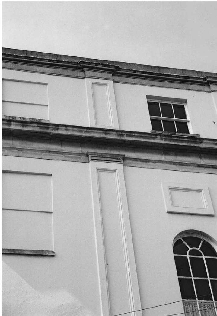
Fig. 3. Detail of North Place elevation of St Margaret's Terrace.

The architect at Cheltenham evidently copied Soane's design almost down to the last detail, as everything tallies: the moulding of the stone base; the ends of the balcony, which curves curving back towards the façade; and the shape of the sinuous railings linking the handrail to the stone base. According to Ptolemy Dean this pattern is known as 'strigillation'. Dean wrote, regarding its use by Soane at Moggerhanger House, Bedfordshire: 'The pattern of this ironwork is derived from strigillation, a favoured Soane motif of the 1790s. It can be seen on the vases for the book room at Wimpole'. 38 And regarding Wimpole Hall, Cambridgeshire, Dean writes: 'Book room: