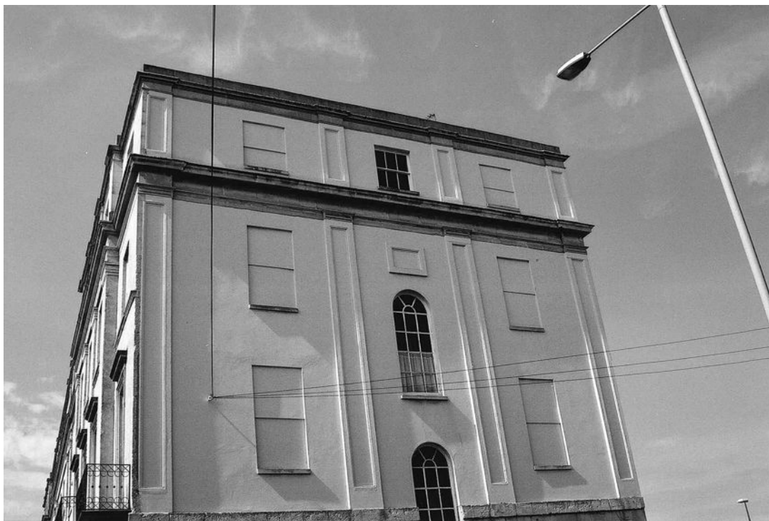
Fig. 2. North Place elevation of St Margaret's Terrace (1819–25), St Margaret's Road, Cheltenham.

the first-storey panel pattern, and the sunken incision following the second-storey windows. The arrangement of the first-storey windows to balcony has considerable finesse and perhaps renders the rest of the façade a little clumsy. Moreover, the projecting mouldings around these windows relate directly to the arched mouldings around the niches and doors on the Masonic Hall façade (Fig. 4), therefore perhaps strengthening Underwood's authorship of 13 Portland Street. 35 If the house was indeed by Underwood, it is perhaps opportune to quote a perceptive contemporary observer of the architect: '[it was] Mr Soane from whom he [Underwood] has invariably avowed that he has derived all the aesthetical knowledge in his possession'. 36