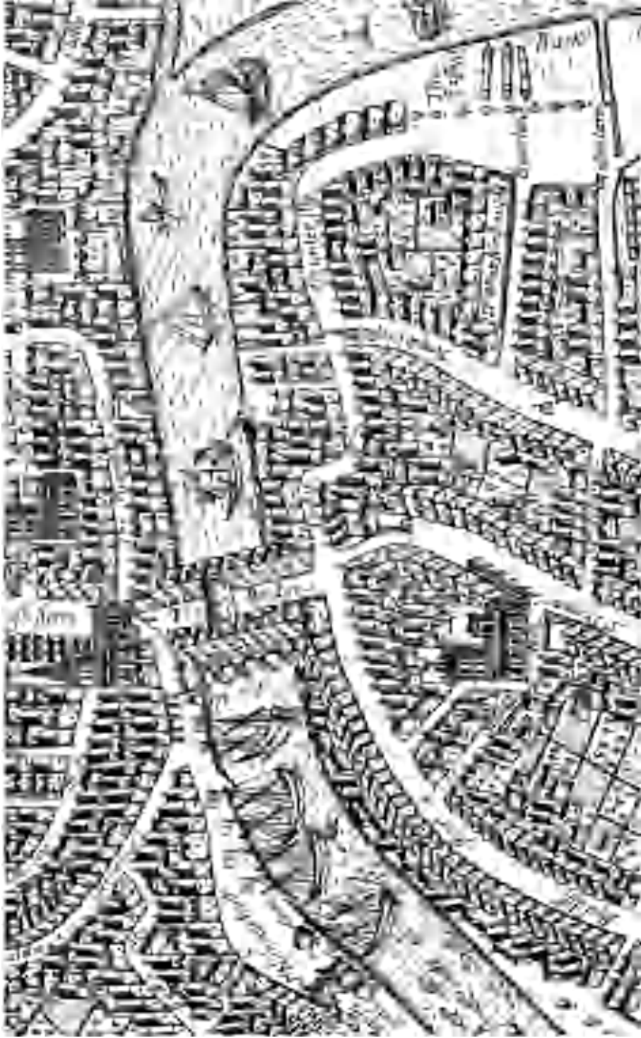
Fig. 2. Detail from James Millerd's An Exact Delineation of the Famous Cittie of Bristol (1673) showing the narrowing of St Thomas Street at Leaden Walls.